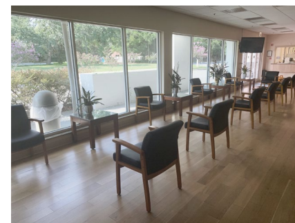
North Florida Surgery Center Lobby: COVID-19 seating arrangement